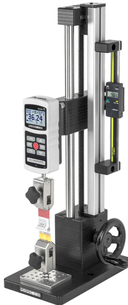
The ES30 is shown in a typical peel testing application, with Series 5 digital force gauge, digital travel display, and film & paper grips.