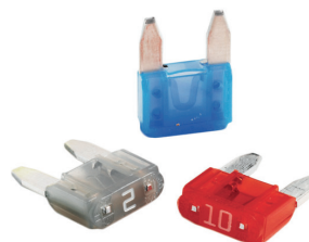
MINI Style Fuses