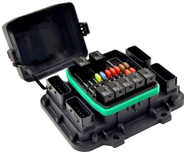
*Fuses and Relays Not Included