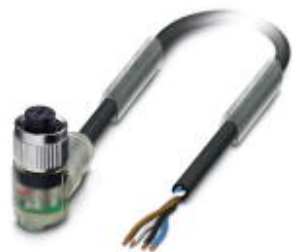
Sensor/actuator cable, 4-position, PUR halogen-free, black-gray RAL 7021, free cable end, on Socket angled M12, A-coded, with 3 LEDs, cable length: 10 m

Please be informed that the data shown in this PDF Document is generated from our Online Catalog. Please find the complete data in the user's documentation. Our General Terms of Use for Downloads are valid ( http://phoenixcontact.com/download )