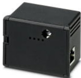
Ethernet communication module for the EEM-MA600 with integrated web server

Please be informed that the data shown in this PDF Document is generated from our Online Catalog. Please find the complete data in the user's documentation. Our General Terms of Use for Downloads are valid ( http://phoenixcontact.com/download )