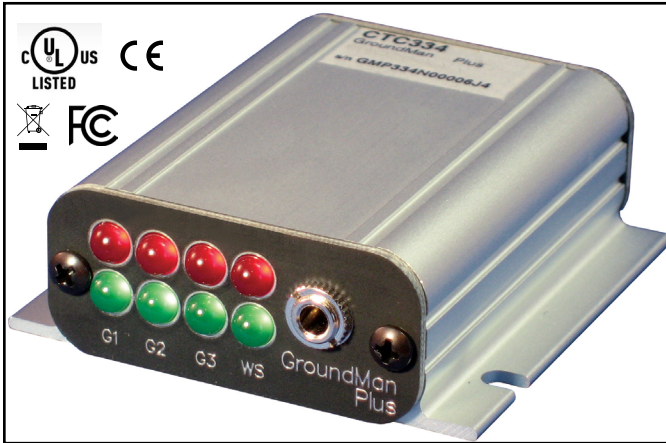
Figure 1. Ground Man Plus Ground Monitor.