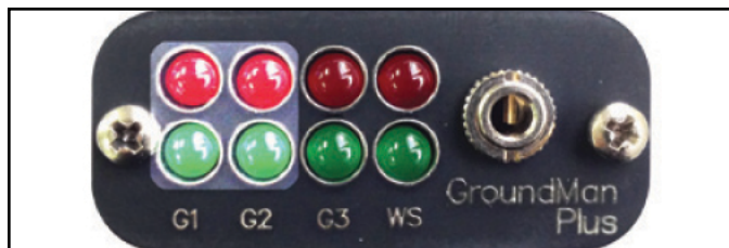
Figure 3. LED lights used to set resistance alarm level.

Verification of G1, G2 and G3 monitoring.