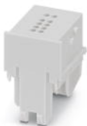
DIN rail housing, 2U for marking lid, Housing cover, width: 18.9 mm, color: light gray (7035)

Please be informed that the data shown in this PDF Document is generated from our Online Catalog. Please find the complete data in the user's documentation. Our General Terms of Use for Downloads are valid ( http://phoenixcontact.com/download )