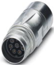
Coupler connector, straight, for standard and SPEEDCON interlock, M17, number of positions: 5+3+PE, type of contact: Socket, Crimp connection, shielded: yes, cable diameter range: 3.5 mm ... 5.5 mm

Please be informed that the data shown in this PDF Document is generated from our Online Catalog. Please find the complete data in the user's documentation. Our General Terms of Use for Downloads are valid ( http://phoenixcontact.com/download )