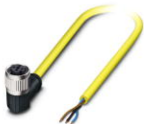
Sensor/actuator cable, 3-position, PVC, yellow, free cable end, on Socket angled M12 SPEEDCON, A-coded, cable length: 5 m

Please be informed that the data shown in this PDF Document is generated from our Online Catalog. Please find the complete data in the user's documentation. Our General Terms of Use for Downloads are valid ( http://phoenixcontact.com/download )