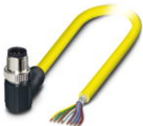
Sensor/actuator cable, 8-position, PVC, yellow, shielded, Plug angled M12 SPEEDCON, A-coded, on free cable end, cable length: 5 m

Please be informed that the data shown in this PDF Document is generated from our Online Catalog. Please find the complete data in the user's documentation. Our General Terms of Use for Downloads are valid ( http://phoenixcontact.com/download )