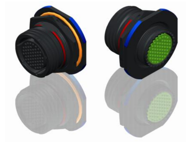
LAYOUT SHOWN AS EXAMPLE