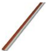
Continuous plug-in bridge, length: 500 mm, color: red

Continuous plug-in bridge - FBST 500-PLC RD - 2966786