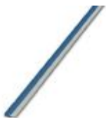
Continuous plug-in bridge, length: 500 mm, color: blue

Continuous plug-in bridge - FBST 500-PLC BU - 2966692