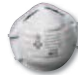
8200 (N95) (07023) UPC: 50051131070238