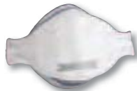
9210 (N95) (37021) UPC: 50051131370215

Suggested Applications: Sweeping, sanding, grinding, sawing and bagging in a non-oil environment.