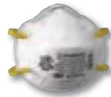
8210Plus (N95) (07048) UPC: 50051131529248