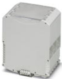
DIN rail housing, Complete housing with metal foot catch, tall design, without vents, width: 67.5 mm, color: light gray (7035)

Please be informed that the data shown in this PDF Document is generated from our Online Catalog. Please find the complete data in the user's documentation. Our General Terms of Use for Downloads are valid ( http://phoenixcontact.com/download )