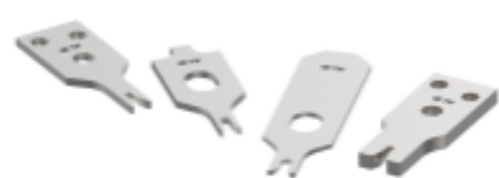
CRIMPER REPRESENTATION ONLY