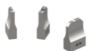
ANVIL REPRESENTATION ONLY