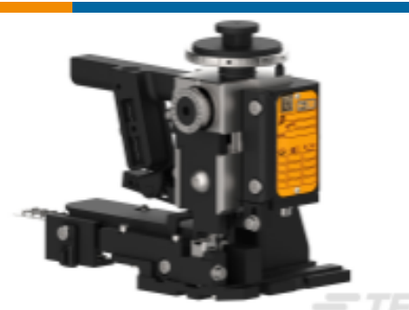
TE Part #2836167-1 OCEAN_2.0_Applicator-S-045F