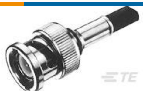
TE Part #227079-9 COMM. BNC-PLUG