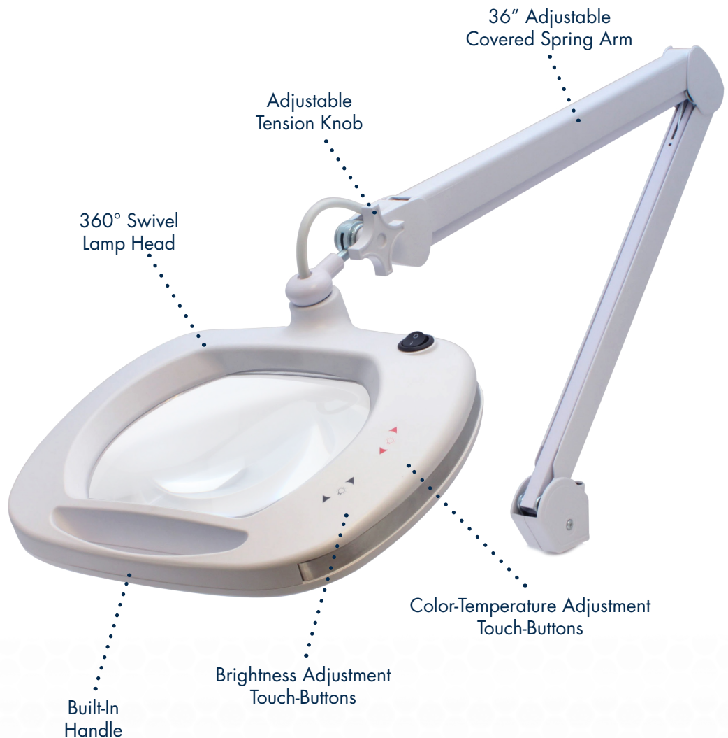
36" Adjustable Covered Spring Arm