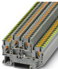
Protective conductor double-level terminal block, connection method: Push-in connection, cross section: 0.14 mm 2 - 4 mm 2 , AWG: 26 - 12, width: 5.2 mm, color: gray, mounting type: NS 35/7,5, NS 35/15

Please be informed that the data shown in this PDF Document is generated from our Online Catalog. Please find the complete data in the user's documentation. Our General Terms of Use for Downloads are valid ( http://phoenixcontact.com/download )