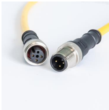
Male and Female 3-pole