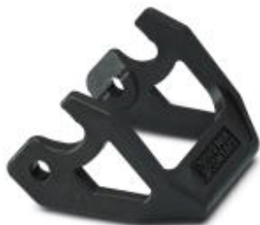
Double locking latch for B10 / B16 / B24 housing, HC-EVO....AL and HC-STA....AL

Please be informed that the data shown in this PDF Document is generated from our Online Catalog. Please find the complete data in the user's documentation. Our General Terms of Use for Downloads are valid ( http://phoenixcontact.com/download )