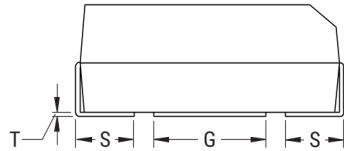
ANODE (+) END VIEW