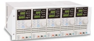
IT-E152 19" Rack Mount Diagram