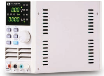
IT6720 60V/5A/100W IT6721 60V/8A/180W