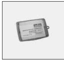
C. Soft Plastic Case