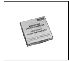
E. 4-3/4x4-3/4x3/4 Hard Plastic Box