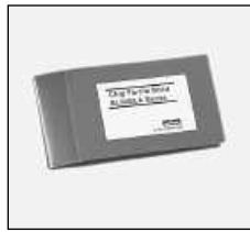
B. 8x4x1 Blue Binder with Sleeves