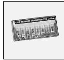
D. 5x2x3/4 Hard Plastic Box