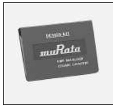
A. 7-3/4x5 Blue Binder with Sleeves