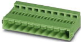
The illustration shows a 15-position version

Please be informed that the data shown in this PDF Document is generated from our Online Catalog. Please find the complete data in the user's documentation. Our General Terms of Use for Downloads are valid ( http://phoenixcontact.com/download )