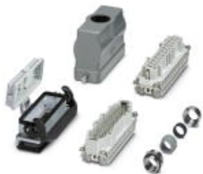
Connector set, consisting of: B24 sleeve housing and panel mounting base, 24-pos. plug and socket insert, M32 cable gland

Please be informed that the data shown in this PDF Document is generated from our Online Catalog. Please find the complete data in the user's documentation. Our General Terms of Use for Downloads are valid ( http://phoenixcontact.com/download )