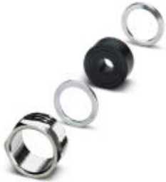
Cable gland, shielded: no, cable diameter range: 6 mm ... 10 mm

Please be informed that the data shown in this PDF Document is generated from our Online Catalog. Please find the complete data in the user's documentation. Our General Terms of Use for Downloads are valid ( http://phoenixcontact.com/download )