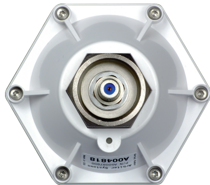
Status LED and Sealed Connector