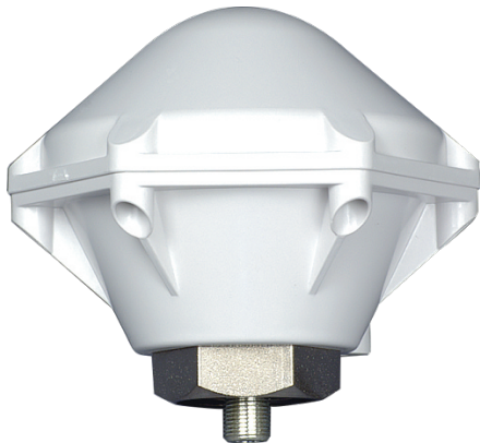
Model AS0099200 GNSS Antenna

Both active antenna and in-line preamplifier are compatible with existing and proposed L1-band Global Navigation Satellite Systems (GNSS), including GPS, GLONASS, and Galileo; and L1-band Satellite Based Augmentation Systems (SBAS) such as WAAS, EGNOS, and MSAS.