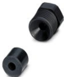
Sensor/actuator connector, accessories, pressure screw and Pg7 seal, for unshielded M12 connector, cable diameter 2.5 mm - 3.5 mm

Please be informed that the data shown in this PDF Document is generated from our Online Catalog. Please find the complete data in the user's documentation. Our General Terms of Use for Downloads are valid ( http://phoenixcontact.com/download )