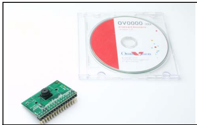
Figure 2-1 EAAR Prototyping Module