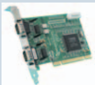
UP-880: uPCI 2xRS232 POS 1A