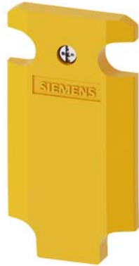
Cover yellow for position switch Plastic 3SE513 Enclosure according to EN N50041