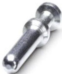
Turned 4.0 crimp contact, individual male contact, core diameter 1.5 mm 2 , silver-plated

Please be informed that the data shown in this PDF Document is generated from our Online Catalog. Please find the complete data in the user's documentation. Our General Terms of Use for Downloads are valid ( http://phoenixcontact.com/download )