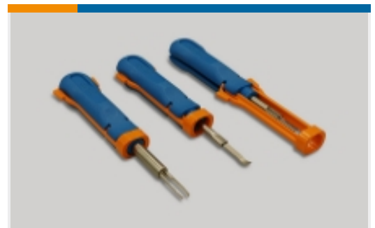
Insertion & Extraction Tools(1)