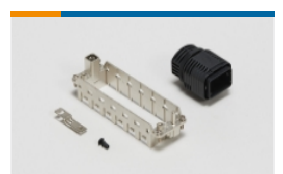
Rectangular Connector Hardware(16)