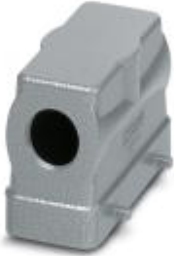
HEAVYCON B16 sleeve housing, for double locking latch, height: 65 mm, with 1 x M25 thread, lateral cable outlet

Please be informed that the data shown in this PDF Document is generated from our Online Catalog. Please find the complete data in the user's documentation. Our General Terms of Use for Downloads are valid ( http://phoenixcontact.com/download )