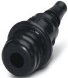
Pneumatic pin, for HC-M-PN3 module, internal hose diameter of 3.0 mm

Please be informed that the data shown in this PDF Document is generated from our Online Catalog. Please find the complete data in the user's documentation. Our General Terms of Use for Downloads are valid ( http://phoenixcontact.com/download )