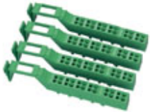
Connector set, for IB IL DO 16, copper, colored identification.

Please be informed that the data shown in this PDF Document is generated from our Online Catalog. Please find the complete data in the user's documentation. Our General Terms of Use for Downloads are valid ( http://phoenixcontact.com/download )