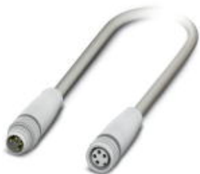
Sensor/actuator cable, 4-position, PP-EPDM halogen-free, gray RAL 7035, Plug straight M8, on Socket straight M8, cable length: 3 m, Hygienic design, with plastic knurl

Please be informed that the data shown in this PDF Document is generated from our Online Catalog. Please find the complete data in the user's documentation. Our General Terms of Use for Downloads are valid ( http://phoenixcontact.com/download )