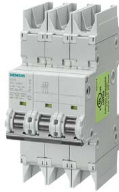
Circuit breaker 10kA, 3-pole, D, 3 A according to UL 489-480Y/277V