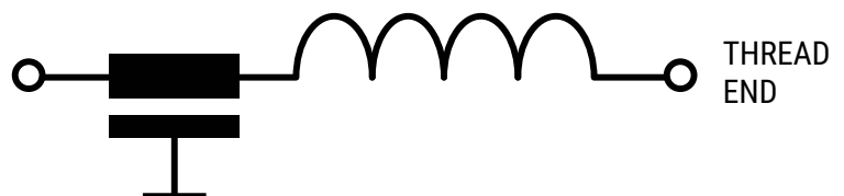
Typical Electrical Schematic