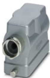
HEAVYCON B16 sleeve housing, for single locking latch, height: 76 mm, with 1 x Pg29 screw connection, lateral cable outlet

Please be informed that the data shown in this PDF Document is generated from our Online Catalog. Please find the complete data in the user's documentation. Our General Terms of Use for Downloads are valid ( http://phoenixcontact.com/download )