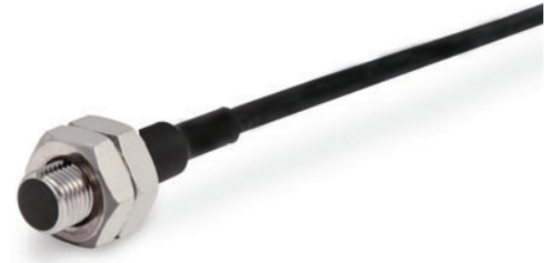
SMX2 • SMX5