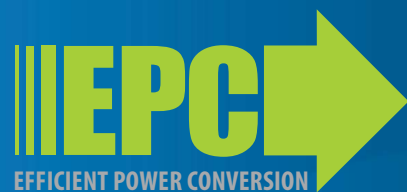
Table data subject to change. Please refer to the Product section on www.epc-co.com