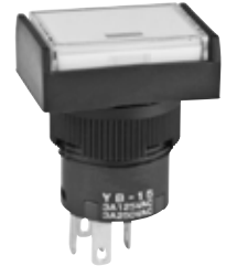
YB Pushbutton with Spot Illumination

The revisions will effect all YB spot illuminated switches with these LEDs, both standard and custom.