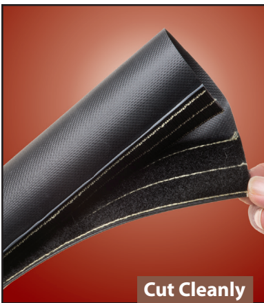
Cut Cleanly Scissor