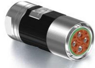
Contact Arrangement mating view

D ST A 001 NN 00 74 0001 000 D S A 001 N 00 74 0001 000