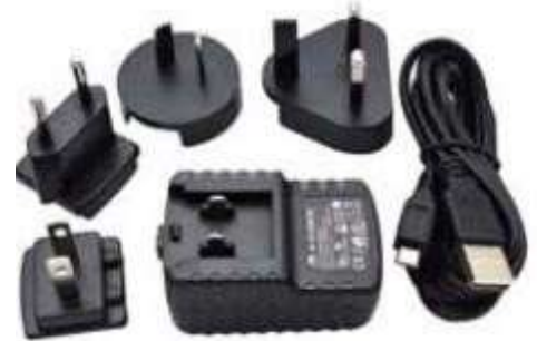
*Product images are for illustrative purposes only and may vary from actual design.