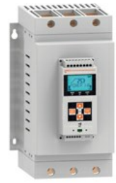
Soft starter ADXL Asynchronous three phase

Product designation Product type designation Motor type