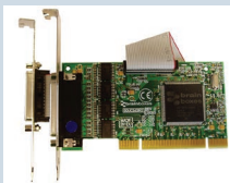
UC-295: uPCI 4xRS232 + LPT Printer Port