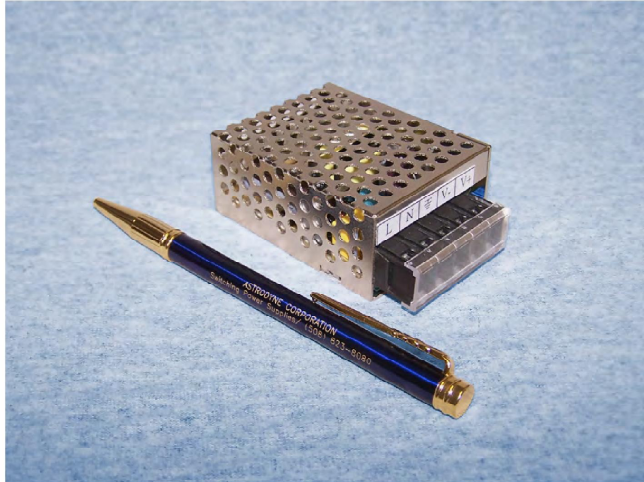
2.59"W x 2.0"L x 1.1"H