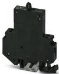
Thermomagnetic circuit breaker, 1-pos., normal blow, 1 N/O contact, with universal foot for mounting on NS 32 or NS 35

Please be informed that the data shown in this PDF Document is generated from our Online Catalog. Please find the complete data in the user's documentation. Our General Terms of Use for Downloads are valid ( http://phoenixcontact.com/download )