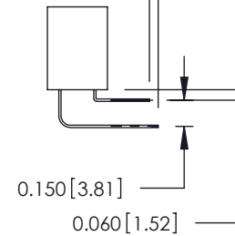
559 Contact Code

0.240 [6.10] Up to 27/54 Pin 0.162 [4.11] 28/56 and Over 0.290 [7.37] Up to 27/54 Pin .212 [5.38] 28/56 and Over