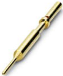
Crimp contact, turned, contact diameter: 0.6 mm, crimp range: 0.06 mm 2 ... 0.25 mm 2

Please be informed that the data shown in this PDF Document is generated from our Online Catalog. Please find the complete data in the user's documentation. Our General Terms of Use for Downloads are valid ( http://phoenixcontact.com/download )